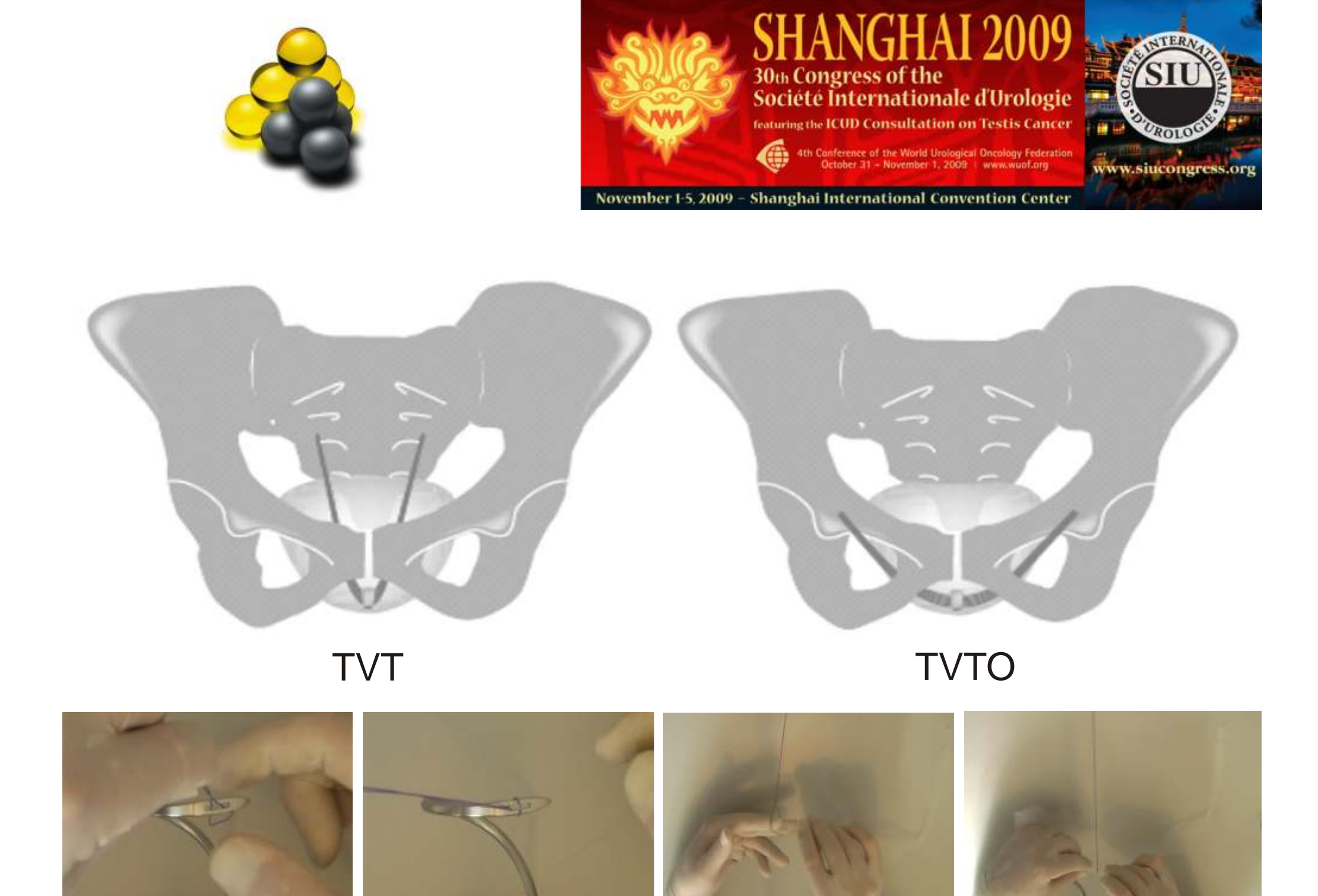
Attaching the thread to the helical introducer.