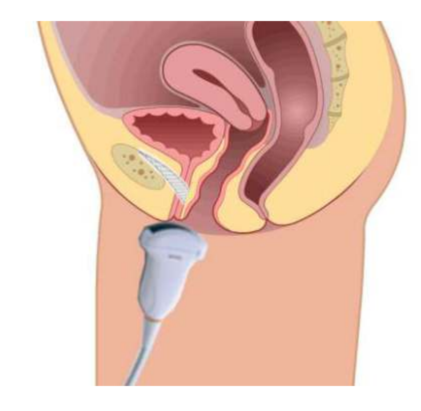
Perineal and introitus ultrasound before and after operation