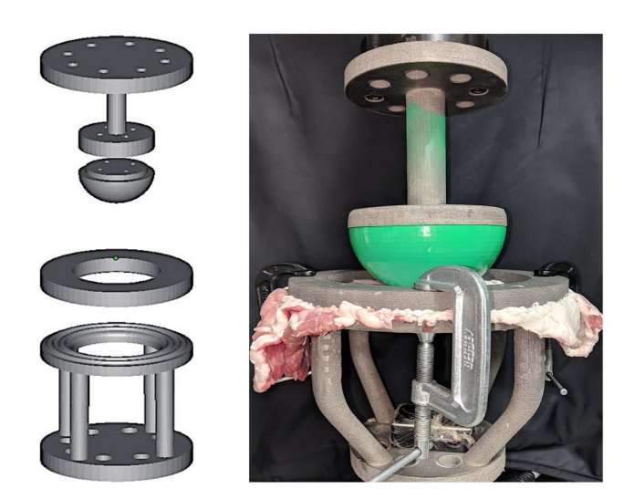
Fig. 2 Ball-burst Apparatus—Right—3D printed titanium with plastic head colored green. Upper portion includes spherical head attached to piston in order to apply force to the sample being held in the ring below. Left: computer-aided design (CAD) image of ball-burst apparatus. Ring diameter of ball-burst apparatus is 7 cm (color figure online)

The ball-burst model was chosen in an effort to better mimic the multi-axial force experienced by the abdominal wall. For