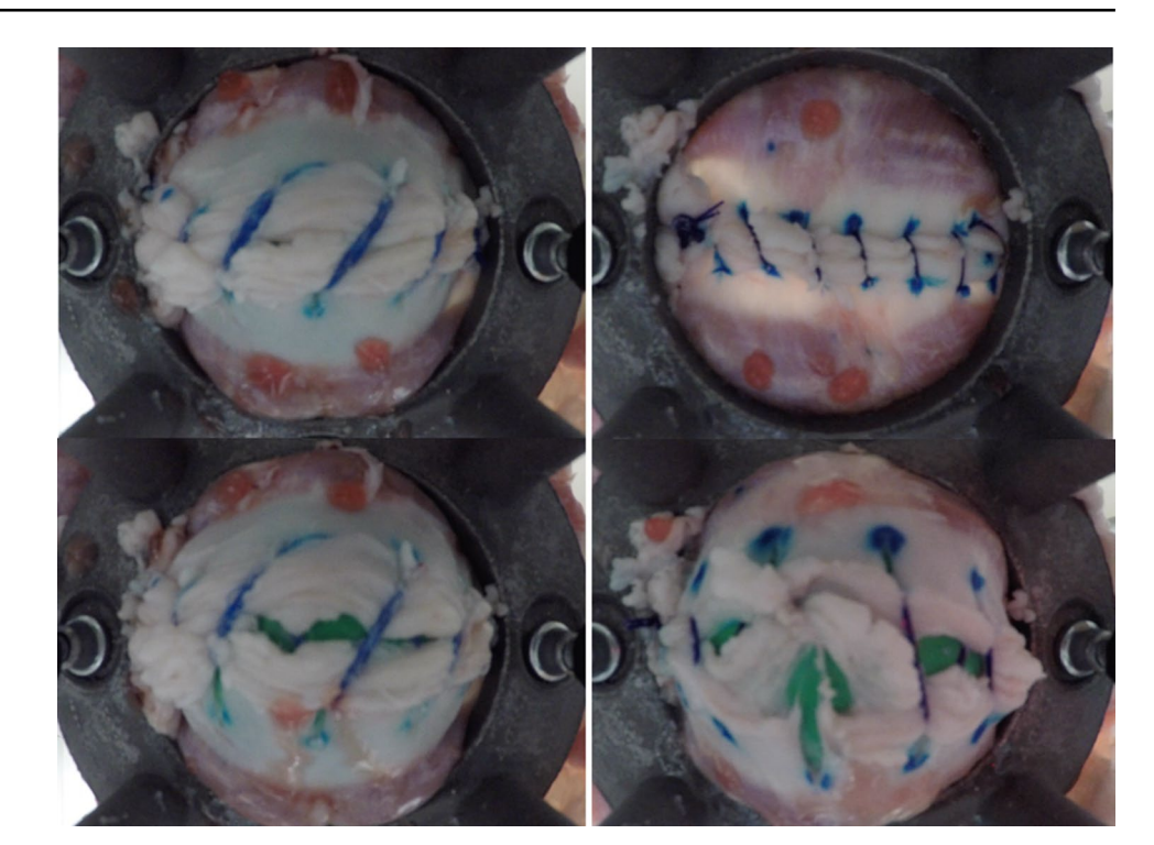
Fig. 3 Screen captures of 0 DuraMesh (left) and 1 PDS double-loop (right) laparotomy closure failure via ball-burst apparatus. The tissue sample is circumscribed by the black ring, and the ball-burst piston is colored in green, pushing through the sutured section of the sample. Top row shows samples prior to pull-through, and bottom row illustrates examples of pull-through