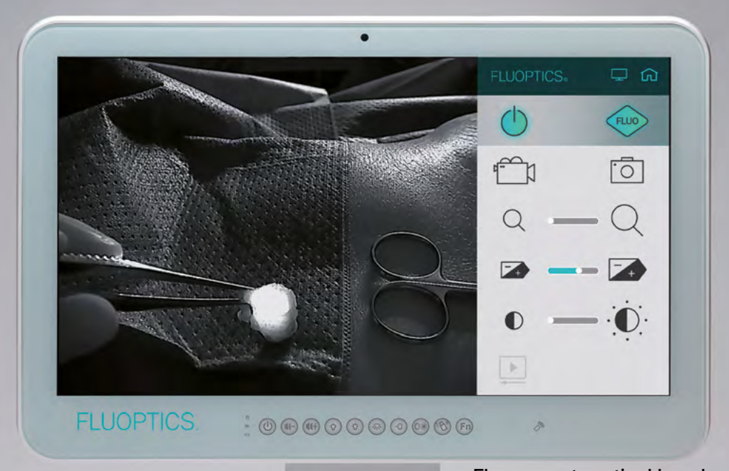
Fluorescent sentinel lymph node ex vivo