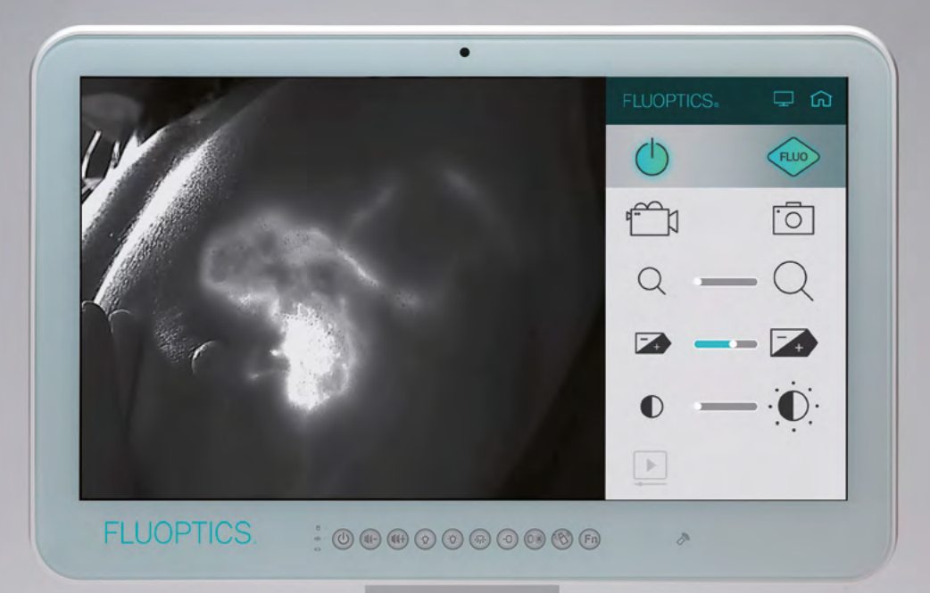
Superficial lymphatic drainage visualization