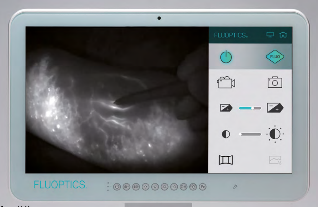
Mapping before LVA