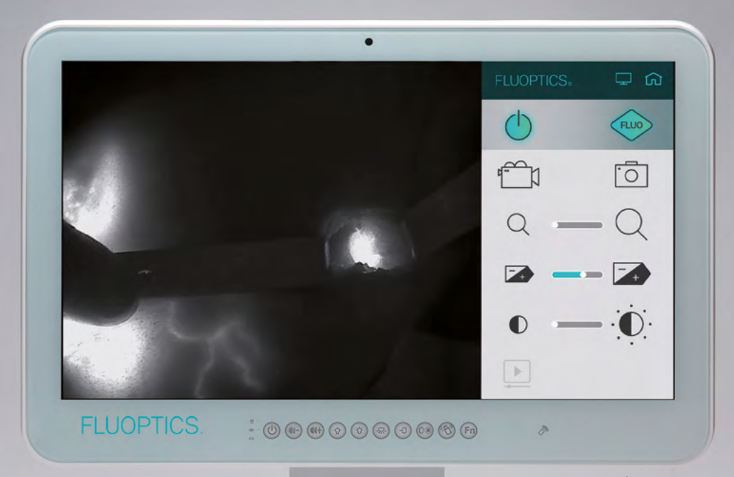
Fluorescent sentinel lymph node in situ