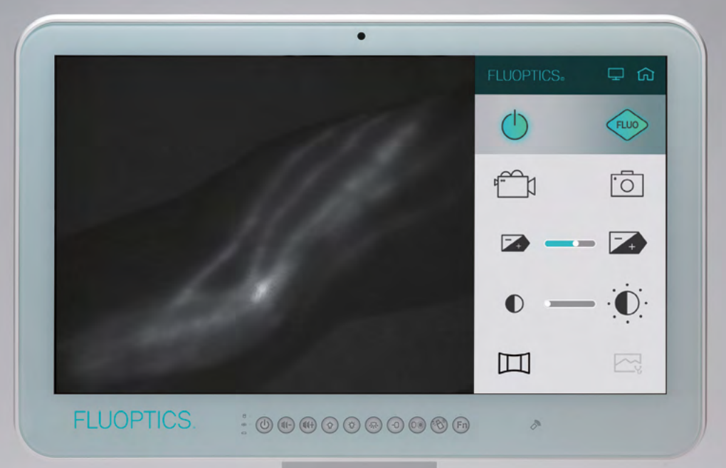
Functional lymphatic vessels