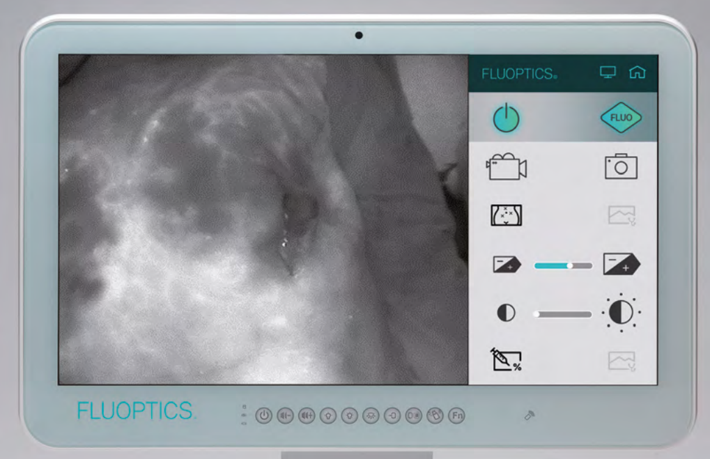
Skin perfusion assessment after skin-sparing mastectomy